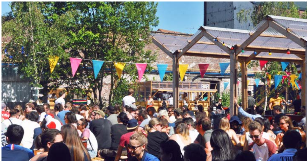
The prefiguration of the Halles Gourmandes welcomed more than 60 000 visitors in 2018.

sustainable outlook, its shared offices with moderate rents, provision of social and solidarity economy figures, and operation in accordance with functional economy principles. La Loco could also provide premises for a grocery store and a « café citoyen », with modest prices. A unique meeting place, open to all.