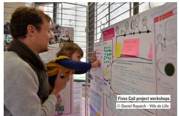
Fives Cail project workshops